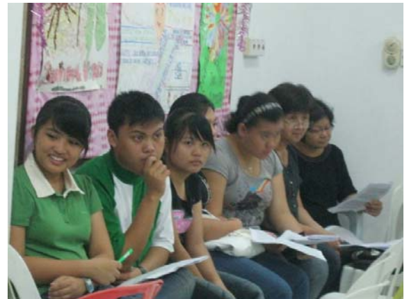
Participants of the study session on Ridvan Message at Miri Bahá'í Centre on 2-4 July 2010.